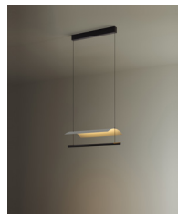
Lámina 45 / 85