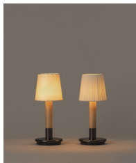
Básica Mínima Batería