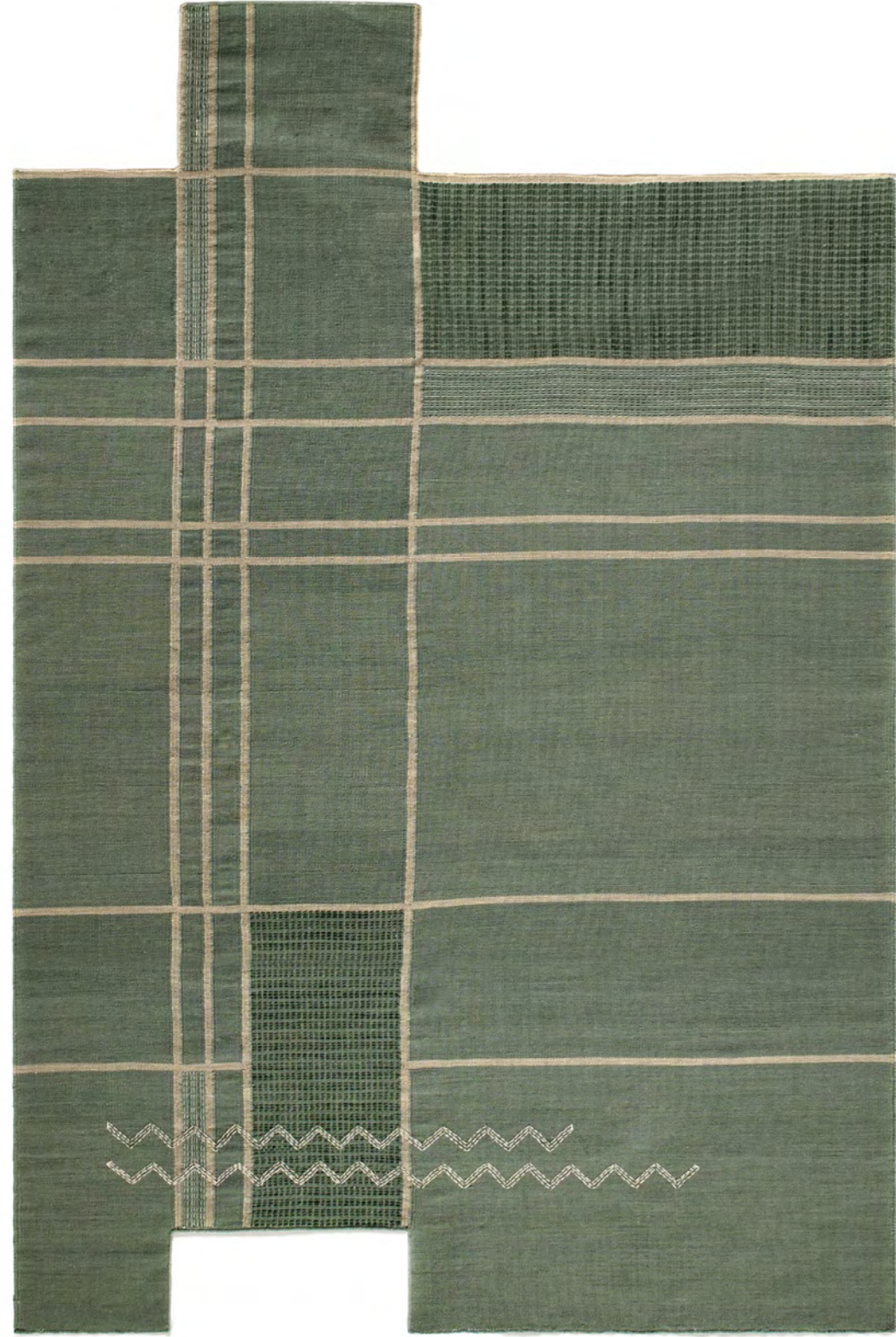
Caminos · Green

Technique: Kilim with embroidery Composition: 100% Wool Height: 8 mm Sizes: 170 x 240 cm · 200 x 300 cm