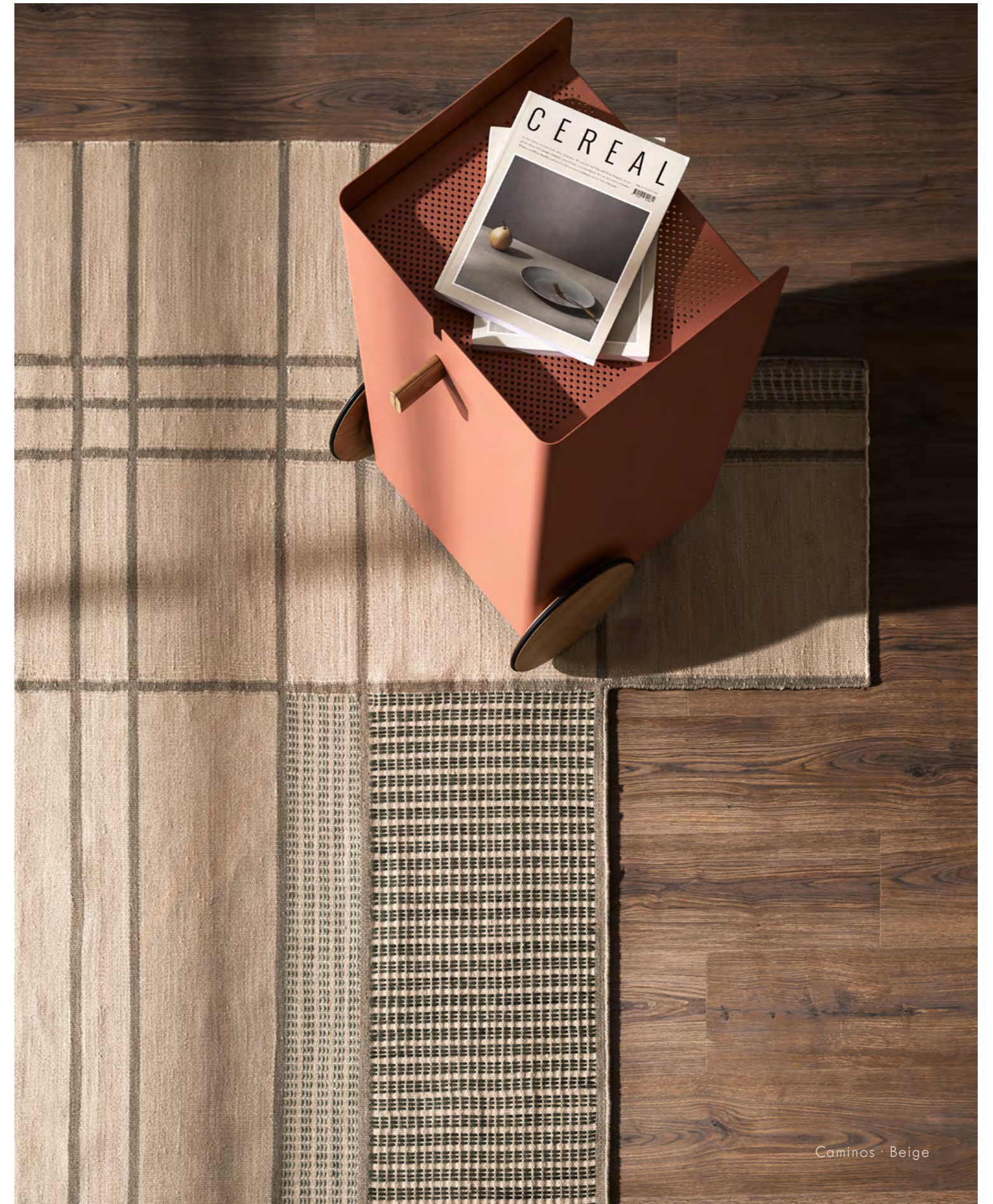
Camino · Beige