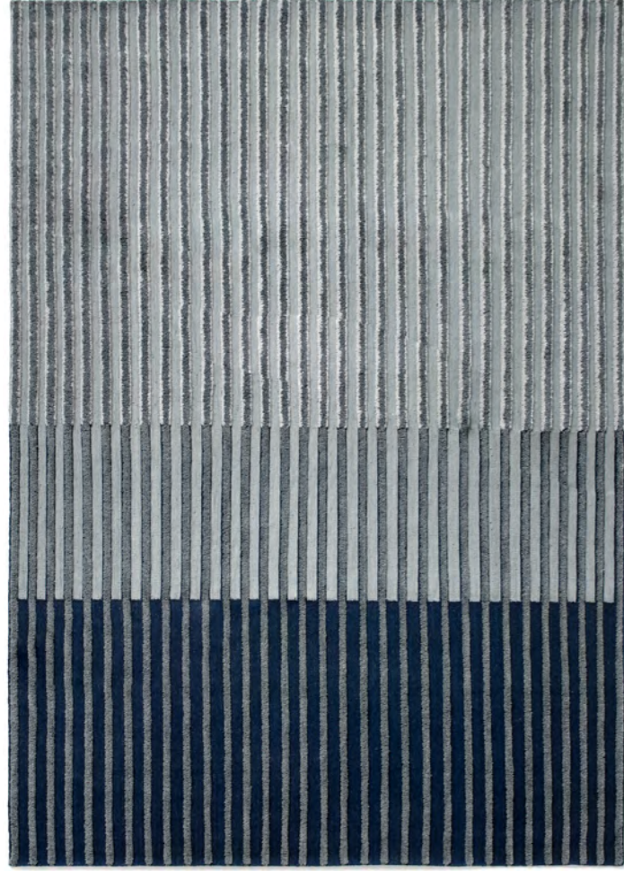
Campos · Blue