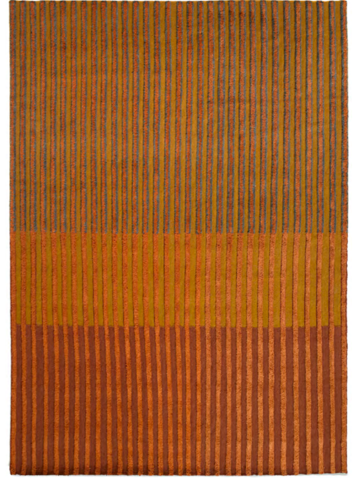
Campos · Orange

Technique: Kilim with pile Composition: 100% Wool Height: 8 mm Sizes: 170 x 240 cm · 200 x 300 cm