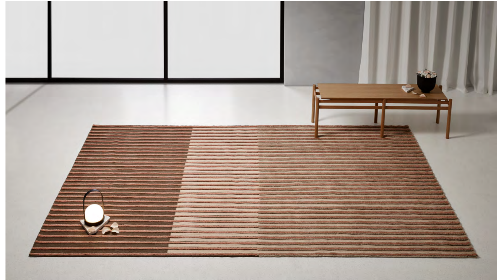
Campos - Blush