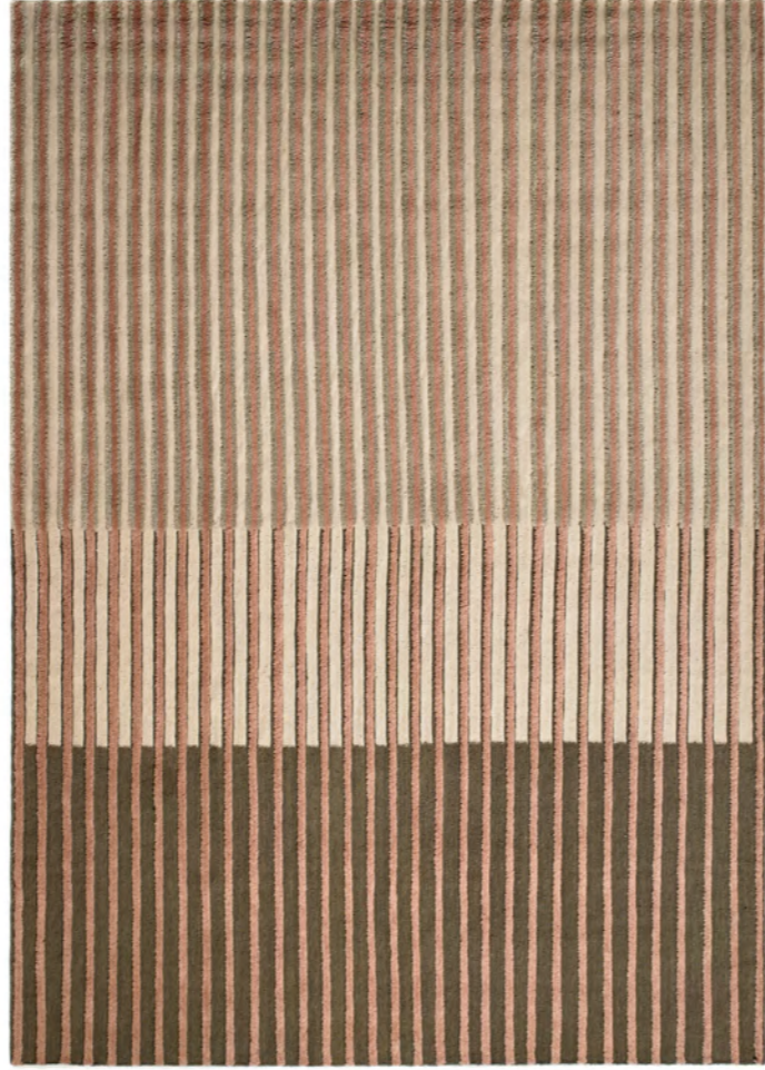
Campos · Blush