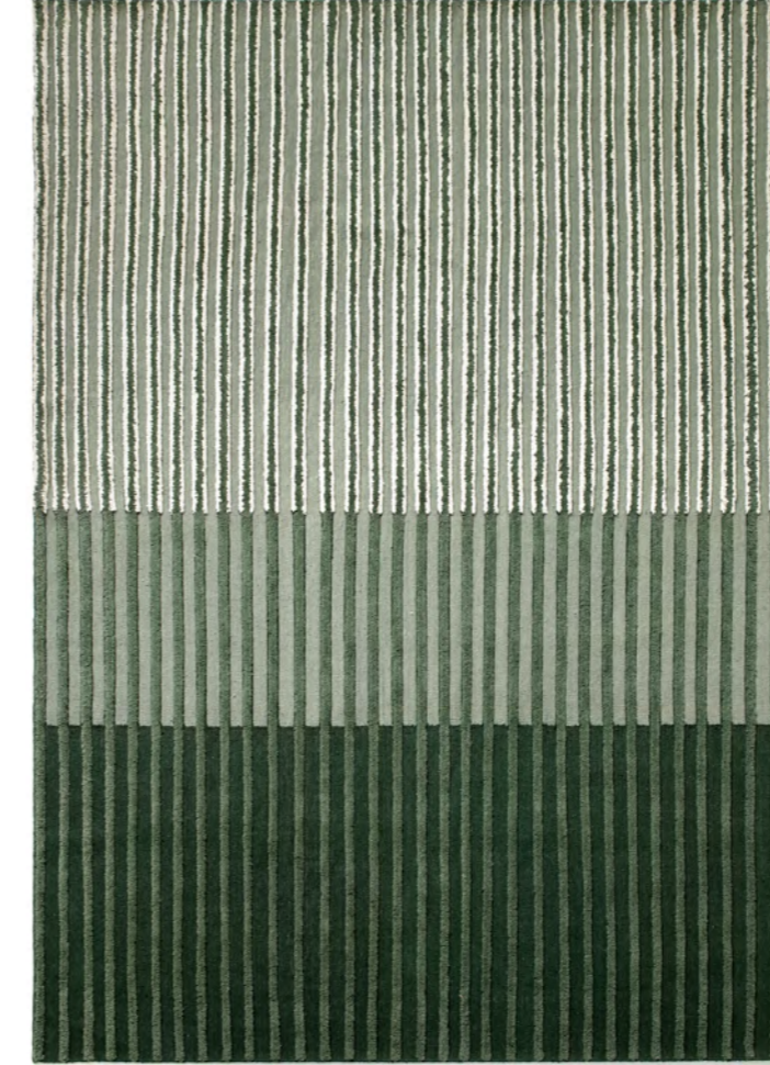
Campos · Green